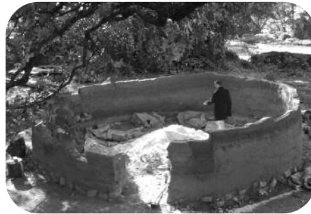
This adobe structure is half-finished

The Furniture Bank of Metro Atlanta is an Atlanta-based non-profit organization that distributes essential furnishings to people in need. ( www.furniturebankatlanta.org )