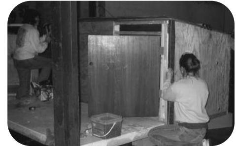
... and a Low Rider at Eyedrum

The exhibit was an excellent opportunity to expose the Mad Housers to a new audience. Visiting art patrons from all over the Atlanta region and Georgia learned first hand about the Mad Housers' work. In addition to the gallery exposure, the Mad Housers were interviewed on the Georgia Public Broadcasting show 'Georgia Gazette'. The exhibit also received positive reviews in the Atlanta Journal Constitution, Creative Loafing and the national magazine 'Art Papers'.