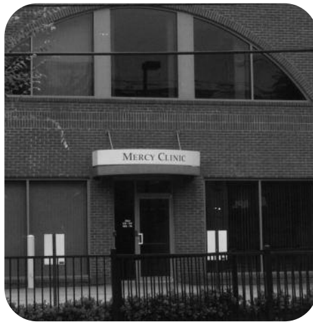
St. Joseph's Mercy Care

Sometimes you might think something is good for you that might not be. It all depends on how you use it. Do you use it to your advantage or not to your advantage. If you have a chance to better yourself, take it. You know, I've always appreciated the person not for who the person is, but for the person's heart.