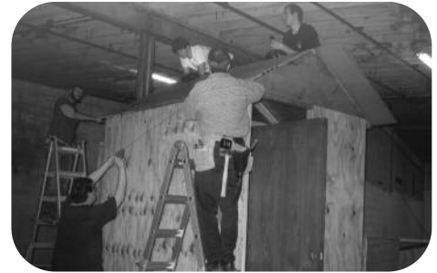
The Mad Housers install a full-height...

Standing in the center of the makeshift village, surrounded by the other artist's structures, was the Mad Housers' exhibit 'Building the Invisible City'. For the exhibit, the Mad Housers erected both of their standard shelter designs: the Low-rider and the Hut. Inside the Low-rider, a computer screen displayed a time lapse photo presentation of a shelter being built from start to finish. The presentation visually demonstrated the Mad Housers' efficient fabrication process. The adjacent Hut's interior walls were covered with forty-eight (8 1/2" x 11") photographs of existing occupied Mad Houser shelters. These photos illustrated how the shelters are eventually occupied by the clients. Posted on the back wall of the Hut was a brief written description of the Mad Housers' history and mission of providing shelters for the homeless community. In keeping with that mission, when the SHELTER show closed, both of the Mad Housers' structures were quickly disassembled, relocated and reassembled as new homes for a couple of homeless clients.