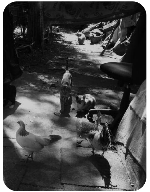
These residents of Bankhead camp have learned to get along despite their differences

The Mad Housers now hold general meetings at the new coffee shop, Octane . They have great coffee and sandwiches, lots of seating, and wi-fi. Visit www.octanecoffee.com for directions.