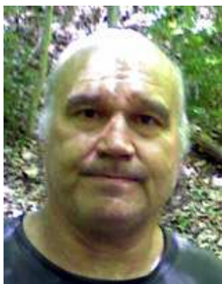
"When I saw that pistol, I said 'the fight is over'"